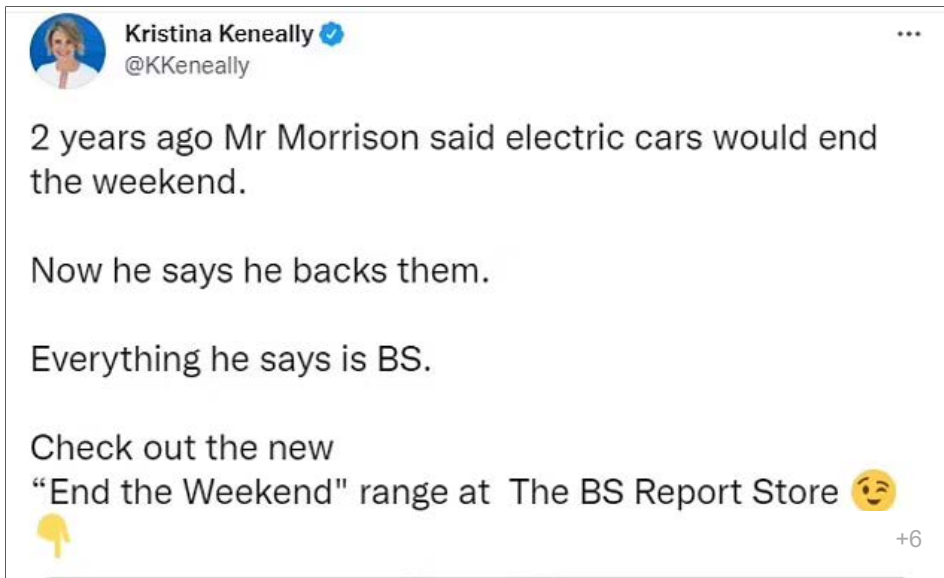
Senator Keneally has advertised her products which are sourced from China on Twitter