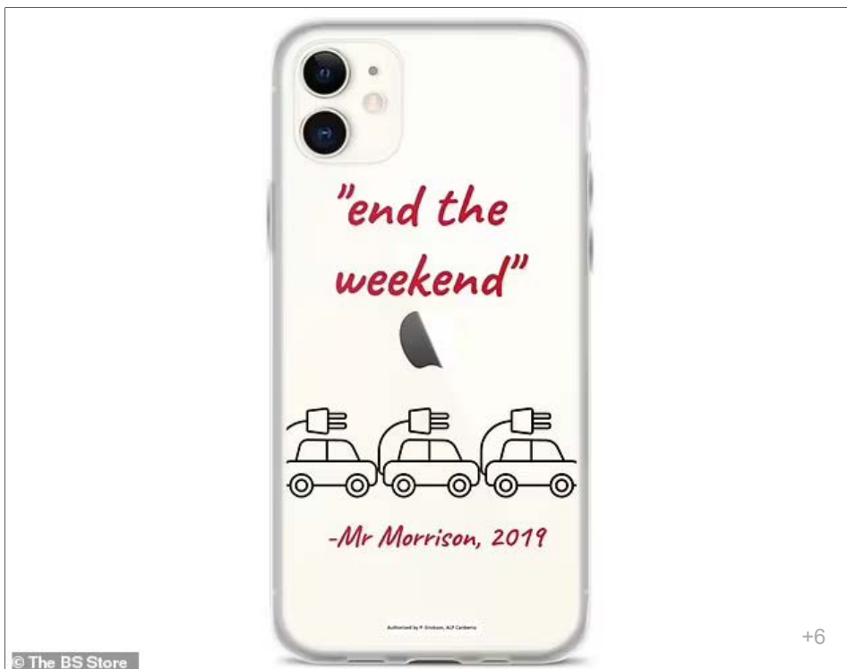
This is one of the phone cases that is on sale on Kristina Keneally's BS Report website for $19.99

'The BS Report uses an on-demand printing service with printing partners in Queensland and Victoria,' she told Daily Mail Australia.