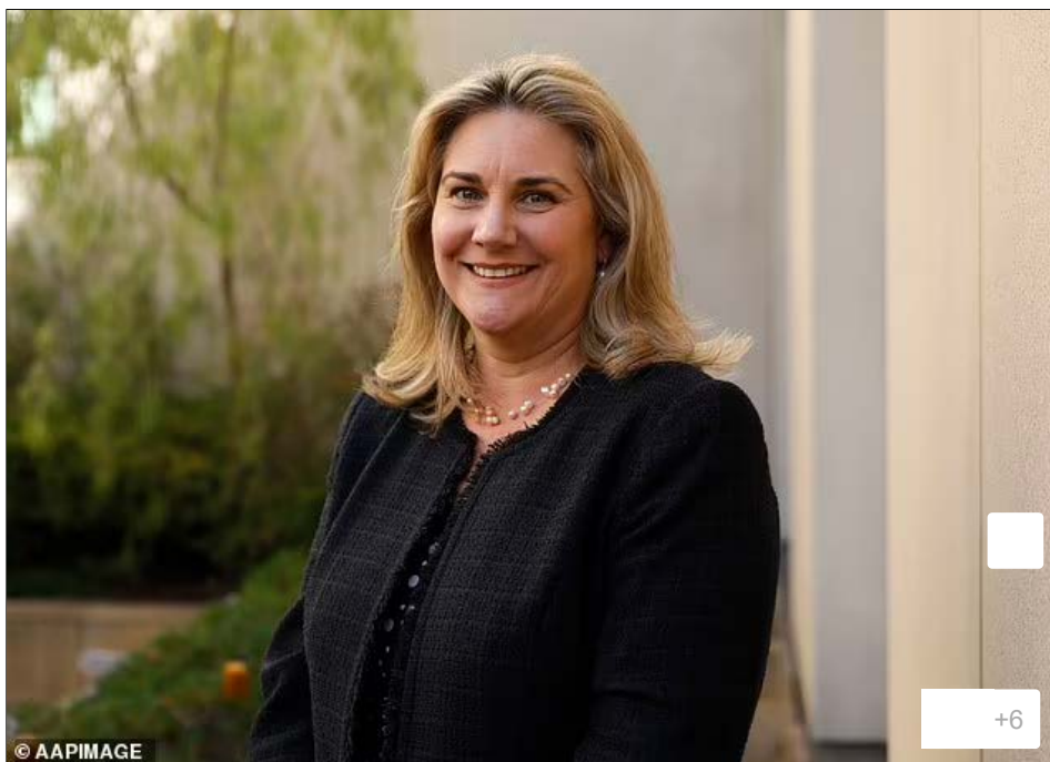
Liberal Senator Hollie Hughes (pictured) accused Senator Keneally, who lives in Sydney's affluent Northern Beaches but will run for the disadvantaged seat of Fowler at the election, of hypocrisy

'Every day it's more and more BS. There are some great products on the BS Report Store and I'd encourage everyone to have a look, share and buy the merchandise to help get rid of Mr Morrison and his BS.'